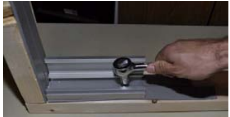
3) Drill holes for size and the number of screws to be used. This depends on frame type and wind load. 12" on-center is common.