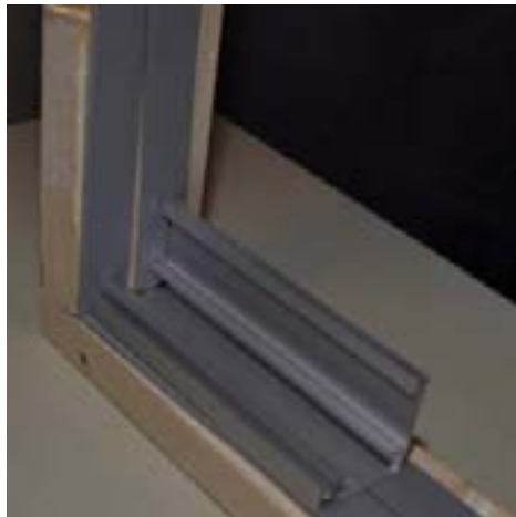
2) Install the "Base" at the first bottom corner