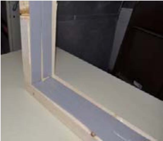
1) Apply glazing tape (or Silicone) to the frame