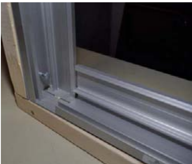
4) create the first "bottom" corner; both parts are "base"