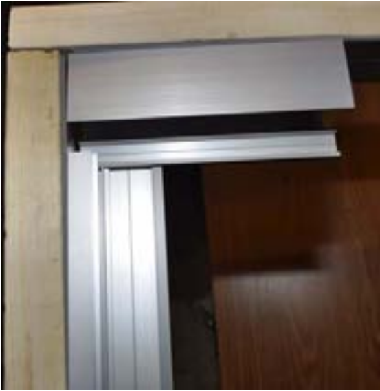
6) first top corner : “U” on top and “base” on the side