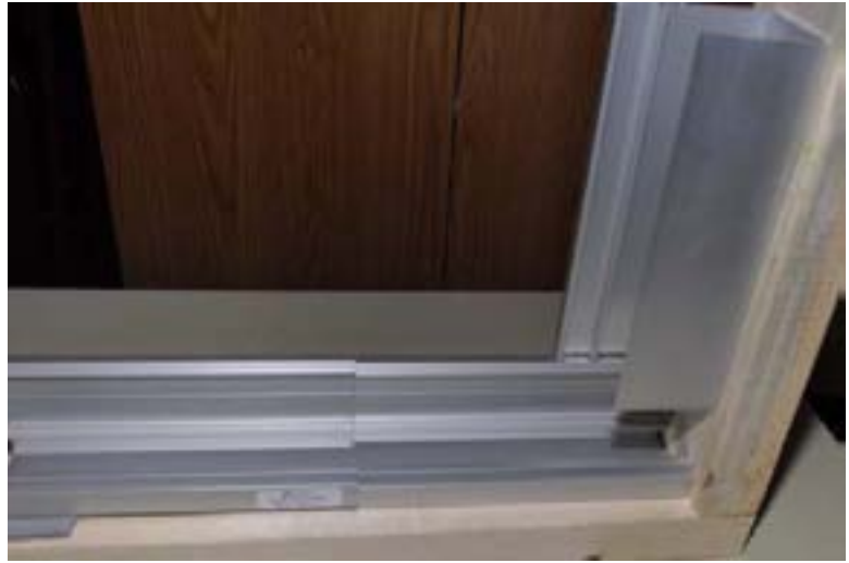
7) second bottom corner will be made of “Base” & “U”