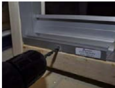
5) weep holes (1/4" every 10" to 12" ) need to be made; it doesn't matter at what installation stage you drill these holes