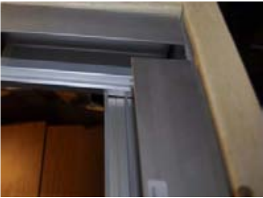
8) Last corner is made with two “U” profiles; profiles may be trimmed to cover the gap between the two profiles