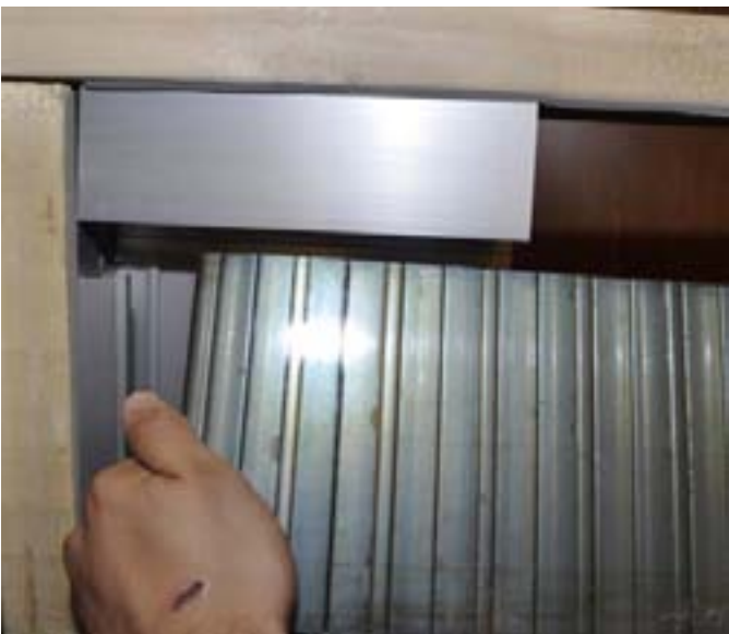
1) Insert the panels into the top profile (“U”). Tilt the panels just enough to allow it to get into the “U” profile